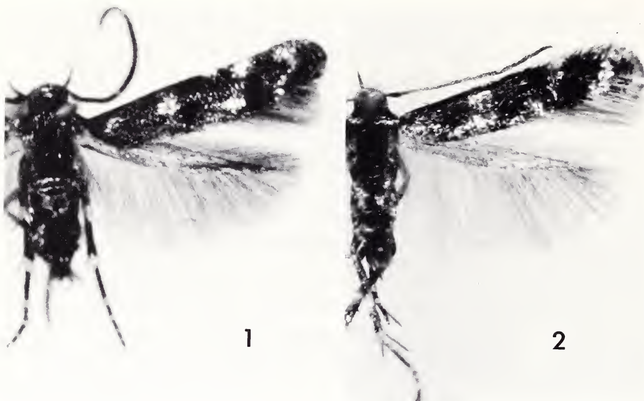
Figs. 1-2. Photographs of Mompha species. 1. M. franclemonti , n. sp., holotype ♂. 2. M. powelli , n. sp., holotype ♂.

fore- and hindwings and white areas, with shining reflections, usually mainly silvery but sometimes with yellow or yellow-gray cast. Mompha franclemonti is most similar to M. powelli but differs as follows: 1) The mesial surface of the labial palpus is paler than the lateral surface and the pale-gray tipped scales are less contrasting on the mesial surface than the lateral surface ( franclemonti ); the mesial and lateral surface of the labial palpus are similarly shaded and hued, and the pale-gray to off-white areas of the scales are large ( powelli ). 2) The forewing has many, small white dots ( franclemonti ); the forewing lacks white dots ( powelli ). 3) The aedoeagus has a nearly parallel-margined, very broadly rounded cornutus and a sclerotized band with tooth-like projections ( franclemonti ); the lateral margins of the cornutus taper within the distal \frac{1}{2} to a slender, rounded apex ( powelli ). 4) The distal lobes of the juxta are separated mesially by a U-shaped area and appear like a pair of nipples ( franclemonti ); the distal lobes of the juxta are separated by a very narrow, V-shaped area, are broad basally and taper laterally within the distal \frac{1}{3} to a rounded apex ( powelli ).